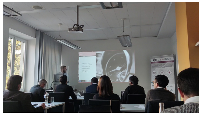
Figure 3: Presentation during the second day of the meeting

The 2 nd Day of the meeting was dedicated to internal trainings on Nanosafety and extrusion, which were conducted by ISQ and Constellium . In order to finalise the day, the consortium visited the ÖGI facilities, where they had the opportunity to have an insightful look into their R&D activities for the FLAMINGO project.