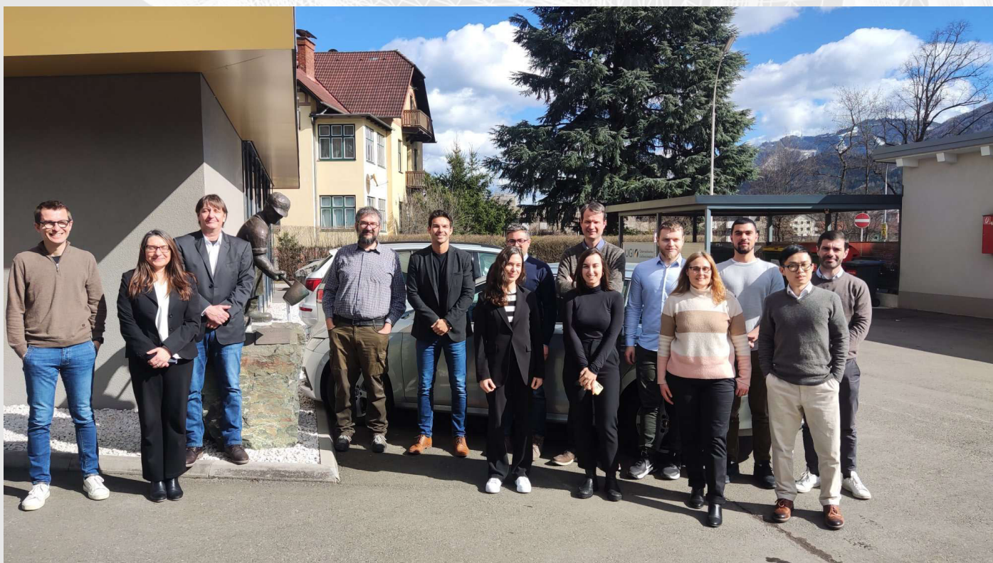
Figure 1: The FLAMINGo consortium